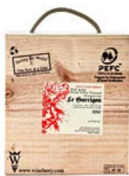
Wine Review: Thinking Inside the Box