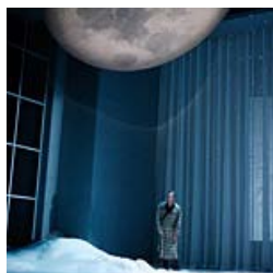
A Summer Blizzard at Glimmerglass