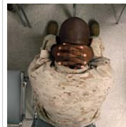
Drugs Found Ineffective for Veterans' Stress

Home | World | U.S. | N.Y. / Region | Business | Technology | Science | Health | Sports | Opinion | Arts | Style | Travel | Jobs | Real Estate | Autos | Site Map