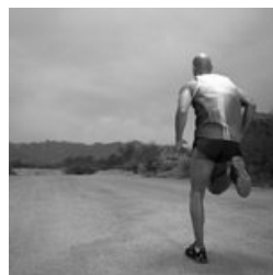
How Chocolate Can Help Your Workouts